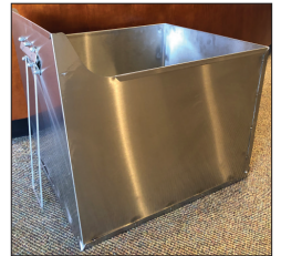
Stainless Steel compactor trash bin

Turn key to the right to open unit for a quick trash removal or to the left for one manual compaction.